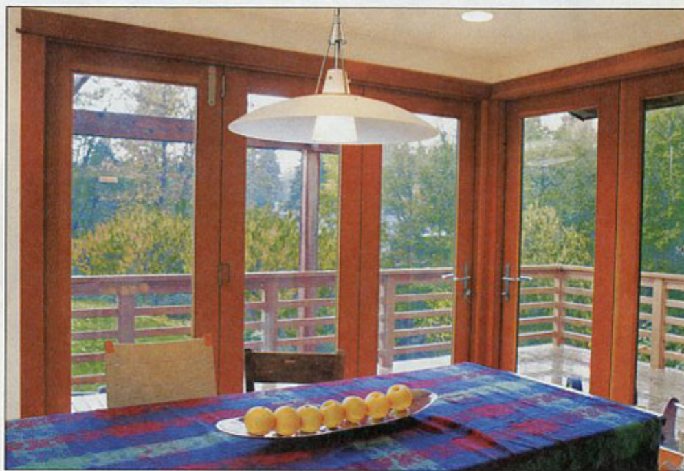
Doors that fold open bring the dining room into the outdoors. The table is Jonna's grandmother's library table from Vancouver, B.C. The light fixture is called Plano by LBL Lighting.